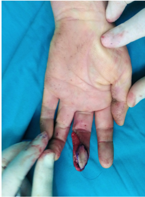
Figure 2d. Flap is rotated 180° as propeller and inset to the pulp defect