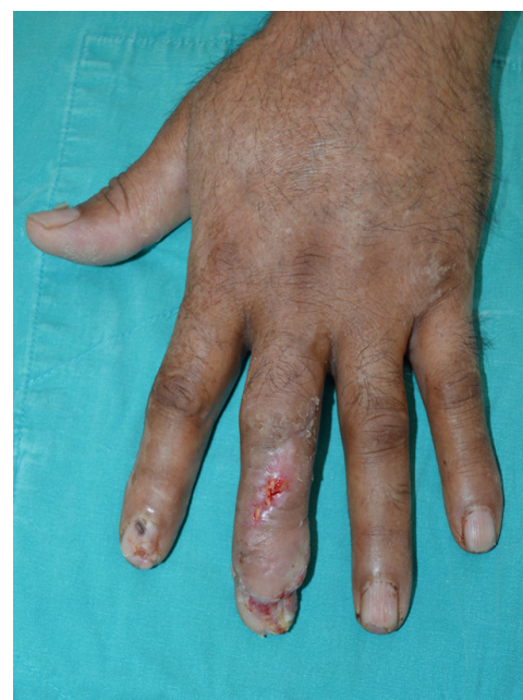
Figure 4b. Postoperative 3 week result is seen