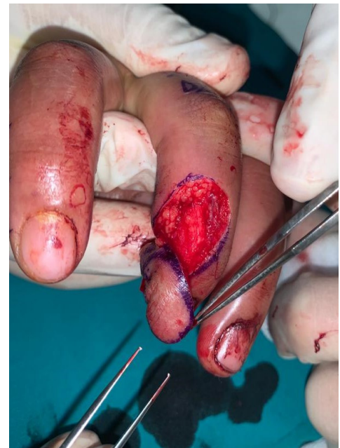
Figure 1b. DAPF rotated solely on its perforator