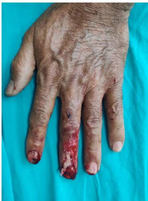
Figure 4a. Fingertip and nailbed defect on middle finger

area and used as a propeller flap, skeletonizing the perforator should be avoided because the perforator branches very small calibered and delicate. Therefore, without sufficient soft tissue envelope, vasospasm and/or thrombosis is more likely to occur and impair the flap circulation in a proximally harvested flap. Another important technical issue is that after DAPF harvest, pedicle should be transferred over the radial or ulnar side of the proximal interphalangeal joint to