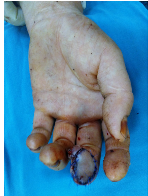
Figure 2e. Immediate postoperative view of the flap is seen. Flap pedicle is not tunneled but rather skin grafted to avoid any compression

stage surgery. However, the main disadvantages are the high risk of venous congestion in the early period, the tiny caliber of the perforator, the risk of kinking, twisting or compression when rotated as propeller. Nonetheless, DAPF is not only quite susceptible to the patient's metabolic status (dehydration, hypotension, etc.), medications, smoking habitus and/or similar substance abuse but also contraindicated in patients who have vasospastic disorders like Raynaud,