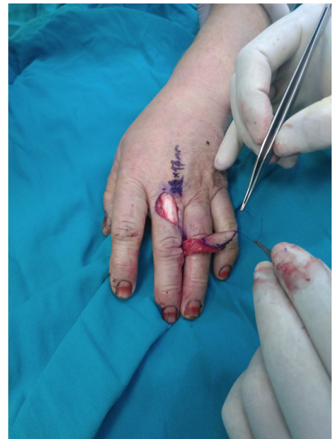
Figure 2c. DAPF, based on ulnar midphalanx located perforator, is raised over paratenon. Note that an adipofascial tissue of 3-4 mm cuff is preserved during flap dissection

the main artery and nerve (12). The most important advantages of DAPF technique are minimal donor site morbidity, allowing early mobilization, and single-