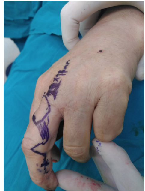
Figure 2b. Flap design

whereas pedicled interpolation flaps or free flaps harvested from the groin-abdominal region may be required in order to cover larger sized defects (8,9). However, interpolated flap techniques require two-stage surgery and may cause stiffness in the joints due to immobilization of the fingers and restriction in range of motion of the fingers. Satisfactory outcomes with good contour and sensory restorations have been reported in the literature using free flaps such as free venous flap, free hemipulp, free thenar flap and free perforator flap of the superficial branch of the radial artery; however advanced microsurgical experience is a must for a fingertip or pulp defect reconstruction using these microsurgical options and duration of operations are quite long compared to conventional ones (10,11). Moreover, these techniques often carry a risk of anastomosis problems, vascular spasm, increased thrombosis rates and high flap loss risk depending on all these factors. Reverse-flow homodigital island flaps are also good flaps of choice and can be used in fingertip and pulp defects reconstruction, but a reverse-flow homodigital flap dissection is more invasive, extensive, time consuming and it causes cold intolerance since this technique necessitates the sacrifice of proper digital artery of the finger.