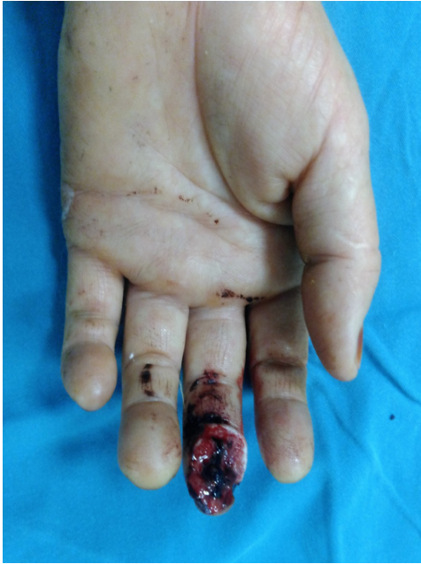
Figure 2a. Volar defect of the middle finger