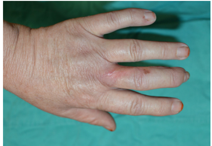
Figure 5b. Donor site morbidity is minimal and the scar is acceptable on long term follow up. Brownish skin lesion on dorsal middle finger is a new burn

preserve joint movements and prevent any possible contractures. Three-dimensional considerations, orientation and direction of the pulp / fingertip defects should also be considered for surgical decision. DAPF reconstruction seems more suitable for obliquely oriented wounds. That is to say, ulnar sided DAPF harvest and inset seems more physiological for the 2nd and 3rd fingertip defects extending obliquely from proximal-ulnar to distal-radial manner, whereas radial sided DAPF is more physiological for 4th and 5th fingertip defects extending obliquely from proximal-radial to distal-ulnar manner since digital artery is often ulnarly dominant in the 2nd and 3rd finger and