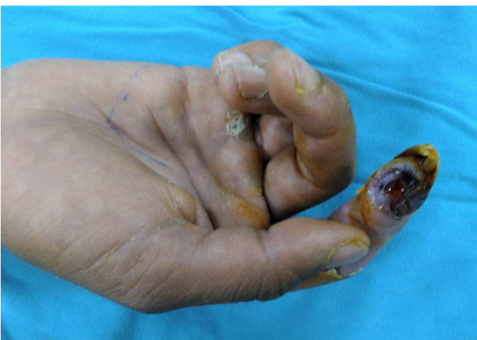
Figure 6a. Index finger soft tissue defect caused by infection

radially dominant in 4th and 5th finger. Nevertheless, variations are not uncommon. Few authors suggest identification and confirmation of perforators of proper digital artery, whether on proximal or middle phalanges, by a handheld Doppler USG prior to flap harvest while most authors advocate that perforator localizations are such constant that DAPF can be raised as a free-style fashion (1,6,7,14). In accordance with this, Braga-Silva et al. have demonstrated on fresh human cadavers that digital artery perforators arise at constant locations in the proximal and middle phalanges at a fixed distance from known landmarks