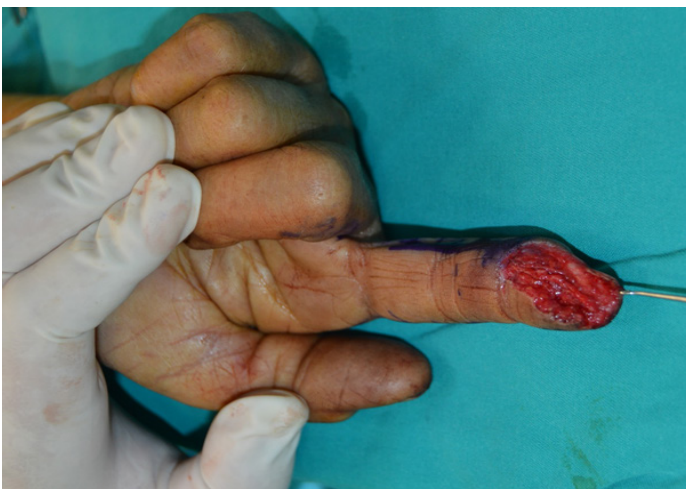
Figure 3a. Index fingertip defect

diabetes mellitus or smoking ones because of higher rates of flap failure (13). Limited flap size and arterial inflow instability are also other disadvantages of DAPF. Although intraoperative circulation was confirmed in the case resulted with total skin necrosis, it was thought that the development of flap necrosis occurred due to vascular spasm and thrombosis induced by smoking and maras powder use known as an oxidant