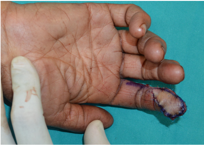
Figure 3c. Final inset of the flap. Note the distal interphalangeal joint is radially deviated