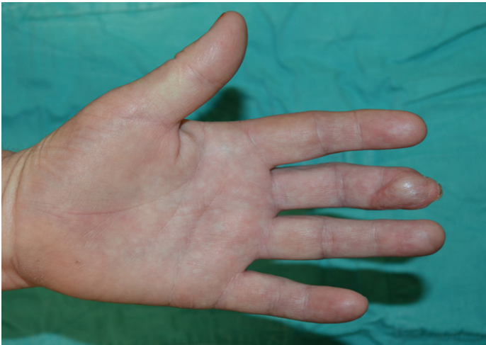
Figure 5a. Satisfactory result on postoperative 4 months (Case 3)