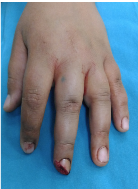
Figure 1a. Oblique distal fingertip defect on middle finger

Principles of fingertip reconstruction are preserving finger function and length as well as maintaining cosmesis and covering the defect with durable, sensitive and glabrous skin. There are various commonly performed local flaps options for reconstruction of small sized finger tip defects, such as V-Y advancement flaps, reverse adipofacial flaps, dorsal metacarpal artery flap, cross finger flap, thenar flap, neurovascular island flaps and reverse-flow homodigital artery flaps, reverse dorsal vein flaps