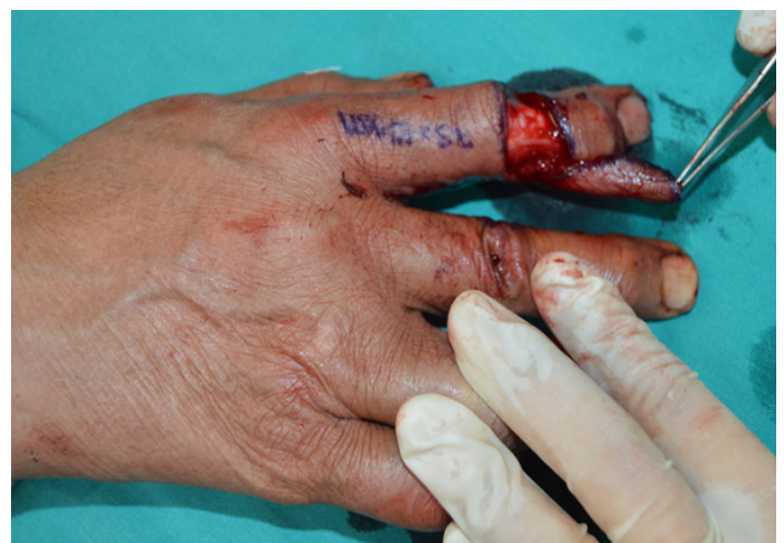
Figure 3b. Flap is raised and rotated