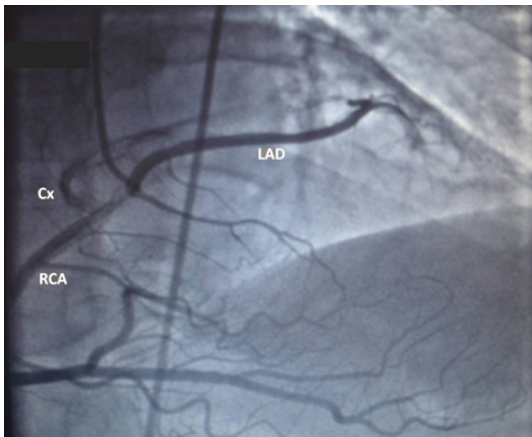
Figure 2. Dominant RCA as well as LAD and Cx arising from right sinus Valsalva and reaching their anatomical area. RCA: Right coronary artery; LAD: Left anterior descending artery; Cx: Circumflex artery.

to big series. The cases of single coronary artery originating from right coronary sinus have risky of mortality before young adulthood. Death commonly occurs during heavy physical activity due to coronary vessel compression. The cases with coronary anomaly coursing between aorta and pulmonary trunk should be operated in case the presence of symptoms such as angina pectoris, myocardial ischemia, syncope and ventricular severe arrhythmias (5). In our case, we demonstrated as an anomaly of coronary artery in which there was no original left main artery and RCA as well as LAD and Cx arteries were originated from right sinus Valsalva. In this case, we found coronary angiography as gold standard good enough since the anomaly could be visualized sufficiently. We did