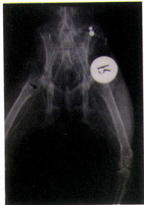
Figure 1. The patent anastomosis in both sides of vessel.

The stenosis was calculated as the width of the vessel at the anastomosis side / the width of the proximal side of the vessel. In figure 1 a patent anastomosis in both sides are seen. In figure 2 a stenosis more than 50% are seen. In the FG (right) side, one vessel have seen to be occluded in angiographic examination. This was our first case and as we have not wait a few seconds to allow the FG to become more viscous it reached inside the vessel. Postoperatively no arterial pulsation was seen