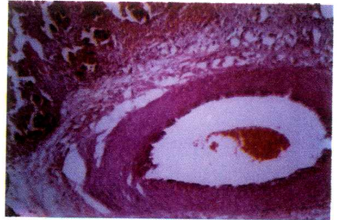
Figure 5. The foreign body giant cells in the anastomotic region. HE, X 40.

achieve a technically satisfactory arterial anastomosis and to reduce the duration of operative intervention (3,4,7,13). Using the technique of FG, we obtained a significant reduction (about % 40) of clampage time of the femoral artery.