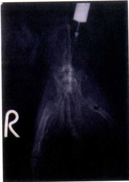
Figure 2. The arrow shows the stenotic anastomotic side.