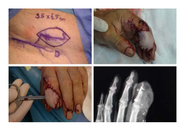
Figure 3. Wound closure with thin SCIP flap. Upper left: Planning of the SCIP flap based on the superficial branch of superficial circumflex iliac artery. Upper right: The lateral view of the closed wound. Below left: Post-op 1 week the dorsal view of the closed wound. Note the thickness of the flap resembles the proximal part of the finger. Below right: X-ray image of the bony reconstruction.

3. Wound Closure and 4. Aesthetic considerations: A thin superficial circumflex iliac artery perforator (SCIP) flap was used for wound closure and aesthetic considerations. A SCIP flap measuring 35x65 mm was harvested from the left groin area. Preoperative planning was conducted with a 20 MHz Clarius® ultrasound. Upon piercing the fascia, the artery was located just 2 mm beneath the skin, allowing for elevation of the flap to a maximum thickness of 5 mm with a 5 cm pedicle length. The pedicle contained one artery and two accompanying veins. The digital artery was dissected 3 cm proximally from the injury zone, and an end-to-side anastomosis was performed