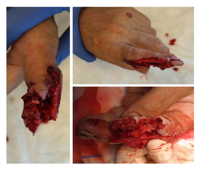
Figure 1. Three images of the amputated finger defect.